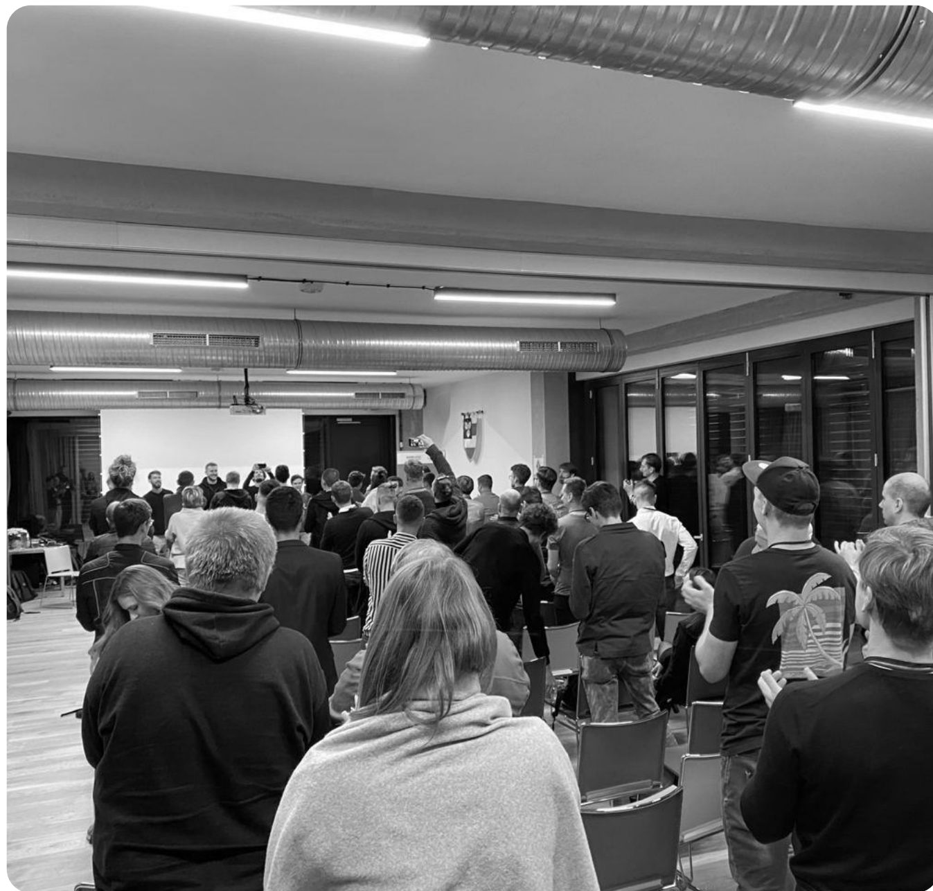
● ETHBrno 2021