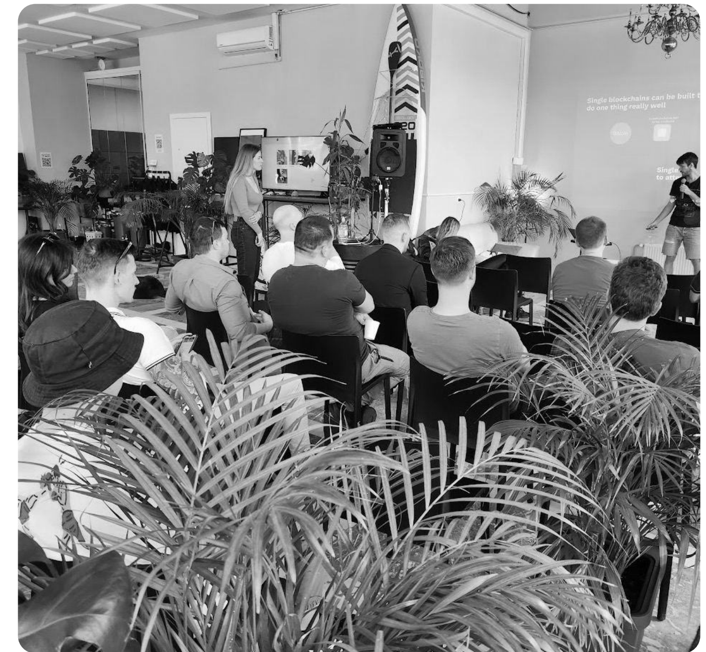
● Subwork Mini Conference