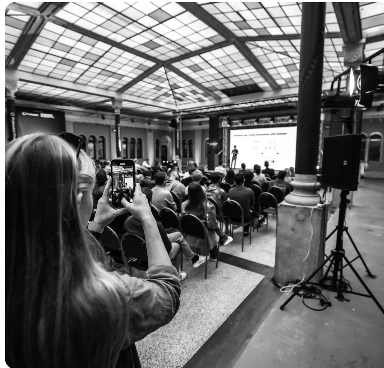
● DOTPrague 2023